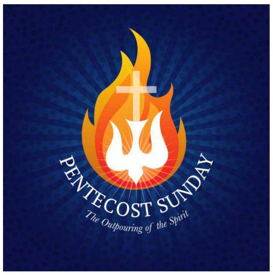
May 27-28, 2023